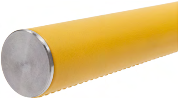
Stainless Steel End Cap