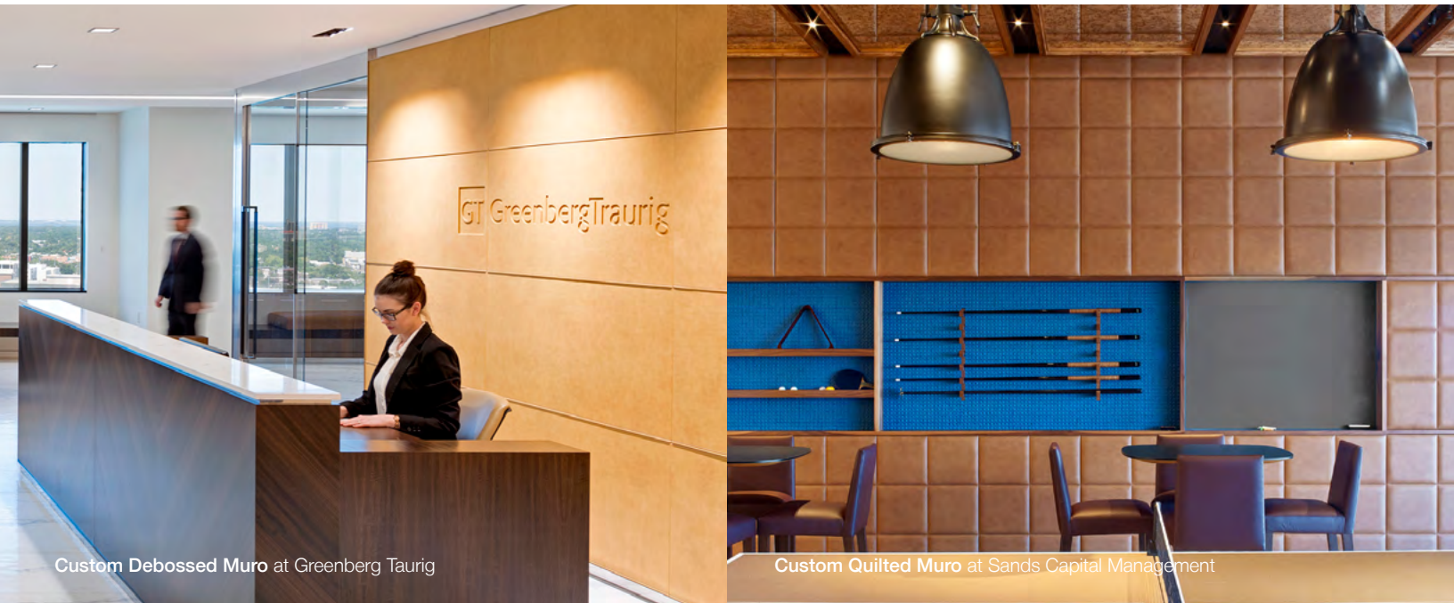
Custom Debossed Muro at Greenberg Taurig