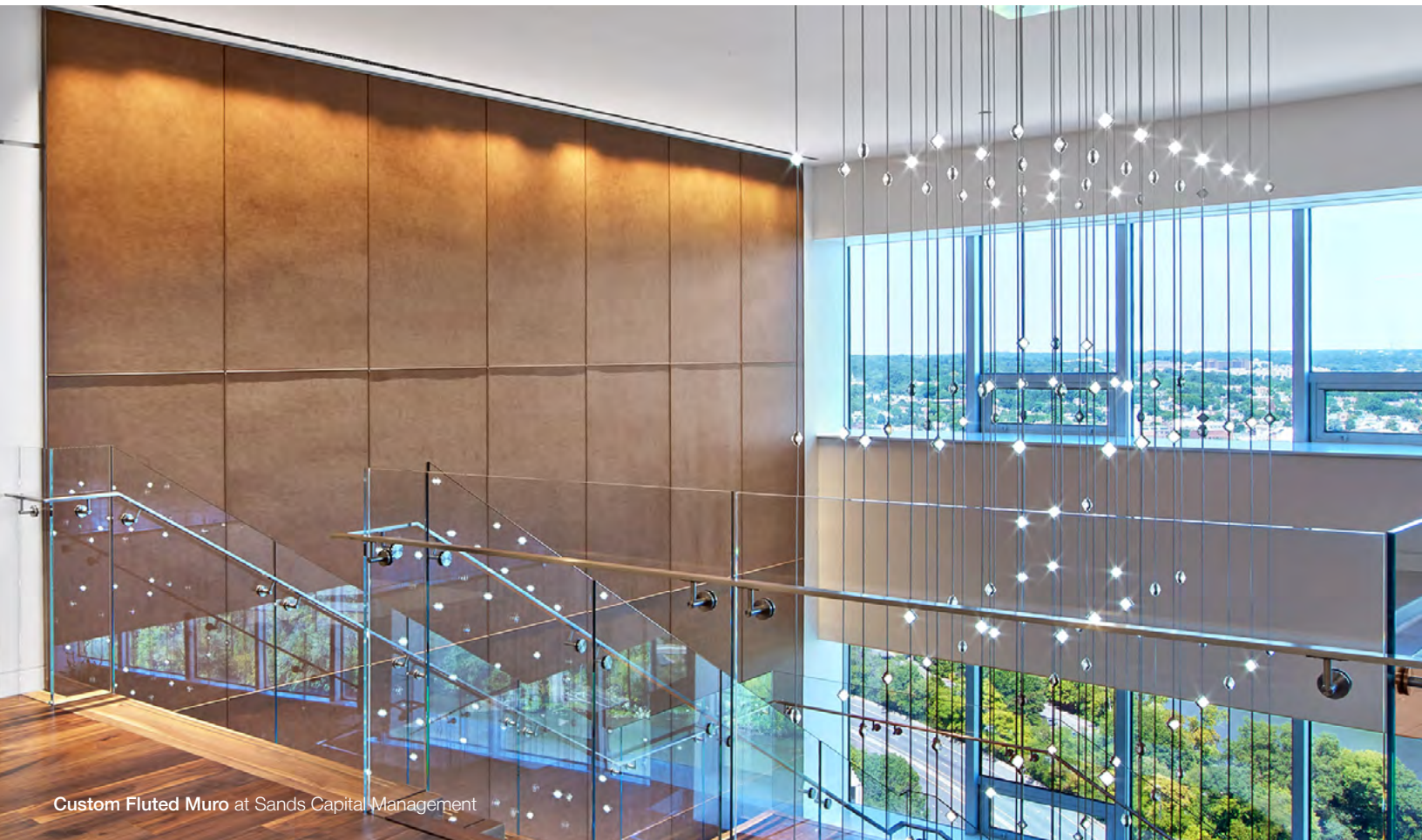
Custom Fluted Muro at Sands Capital Management