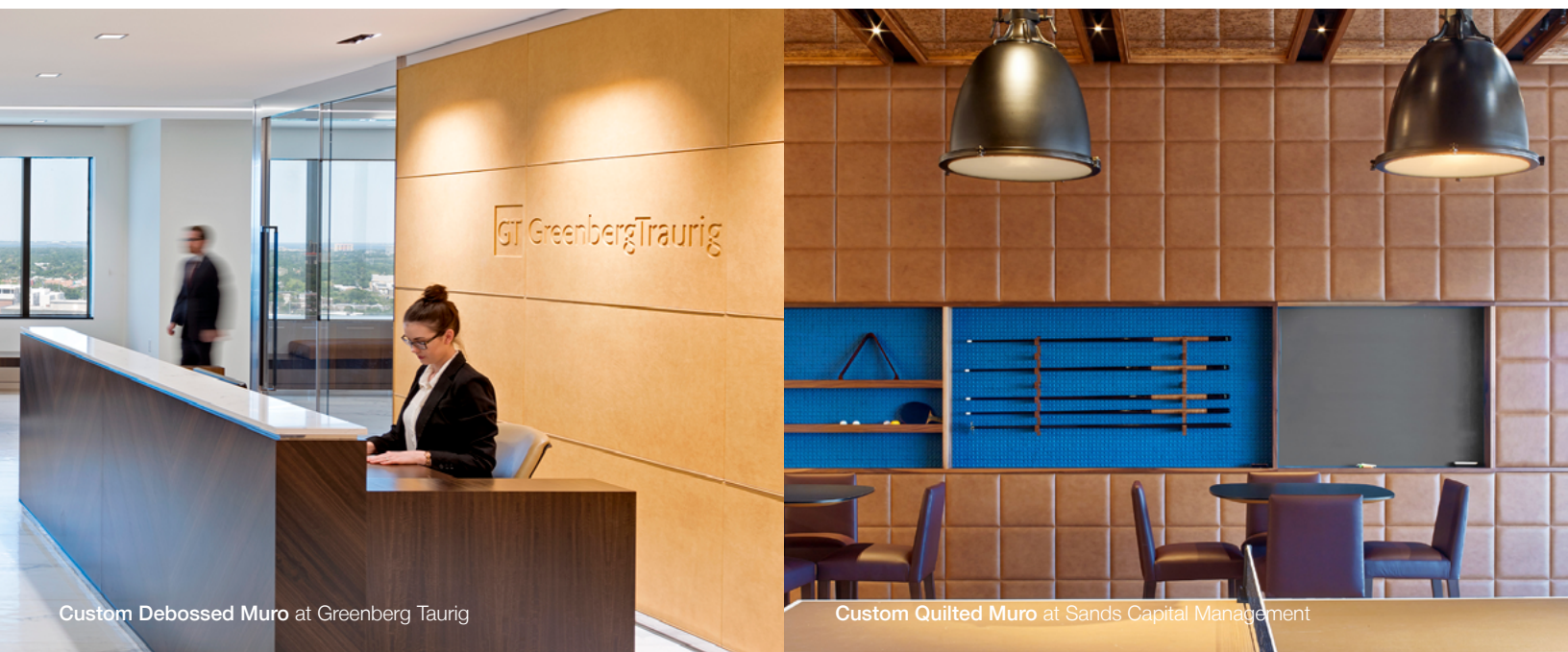
Custom Debossed Muro at Greenberg Traurig