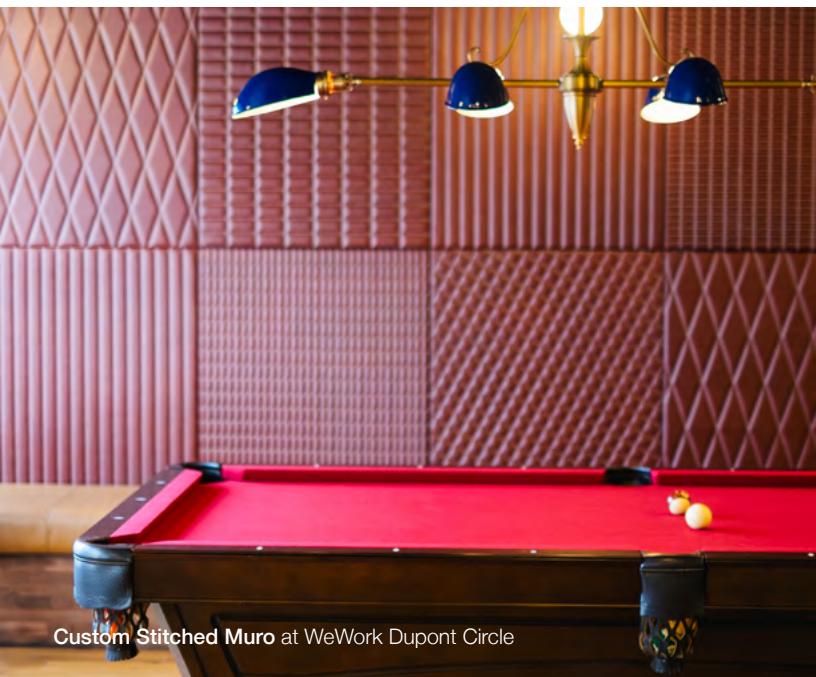
Custom Stitched Muro at WeWork Dupont Circle