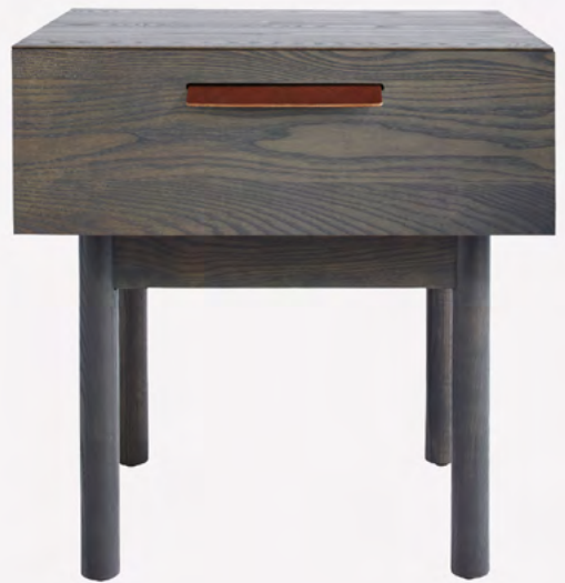
Custom Belting Leather Pulls for Blu Dot