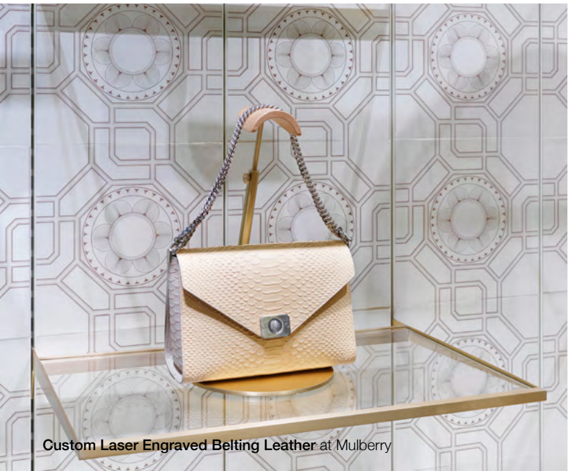
Custom Laser Engraved Belting Leather at Mulberry