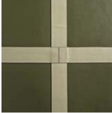
Grid Pattern is fabricated of 12" leather squares with 2" wide overlap. ES8041 square with FE4060 overlap shown.