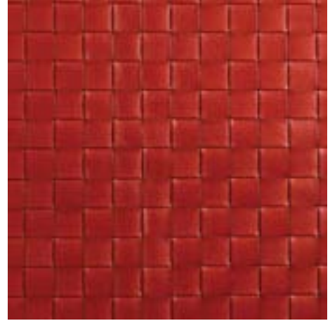
Woven Pattern is created using 1" wide strips of leather. Shown in SA 2010.