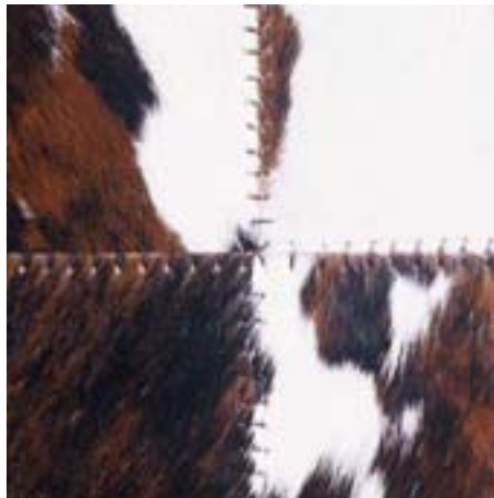
Constructed Haired Hide Rugs are assembled from 10" squares sewn with a heavy cord. Tricolor haired hide shown.