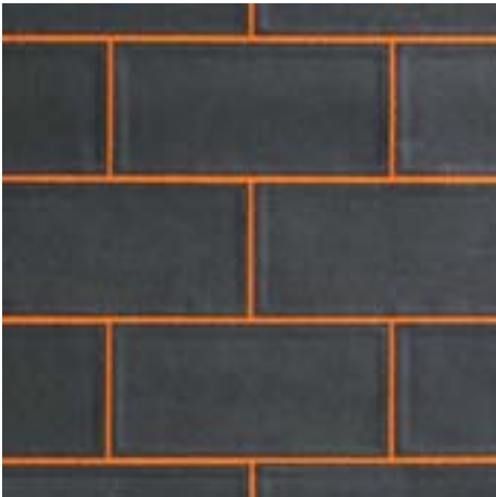
Custom Pattern designed in subway pattern. Shown in DE227 with ES8078 reveal.