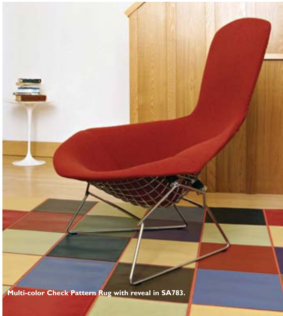
Multi-color Check Pattern Rug with reveal in SA783.

Rugs are offered in three distinct styles: check, grid, and woven. To create a unique check or grid rug, simply select colors for the primary areas and one hue for the reveal. Woven rugs can be monochromatic or multi-color. With custom shapes and sizes, the design options are endless.