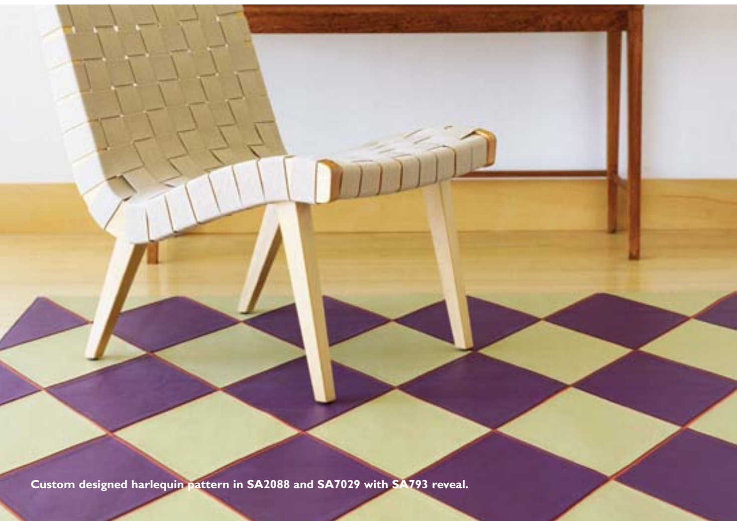
Custom designed harlequin pattern in SA2088 and SA7029 with SA793 reveal.