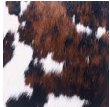
Haired Hides are hides with the hair intact. Hides range in size from 45-55 square feet and are available in various standard colors.

All Spinneybeck Leather is tanned, dyed, and finished in Italy, according to the most stringent environmental requirements. Spinneybeck Leathers are Greenguard® certified.