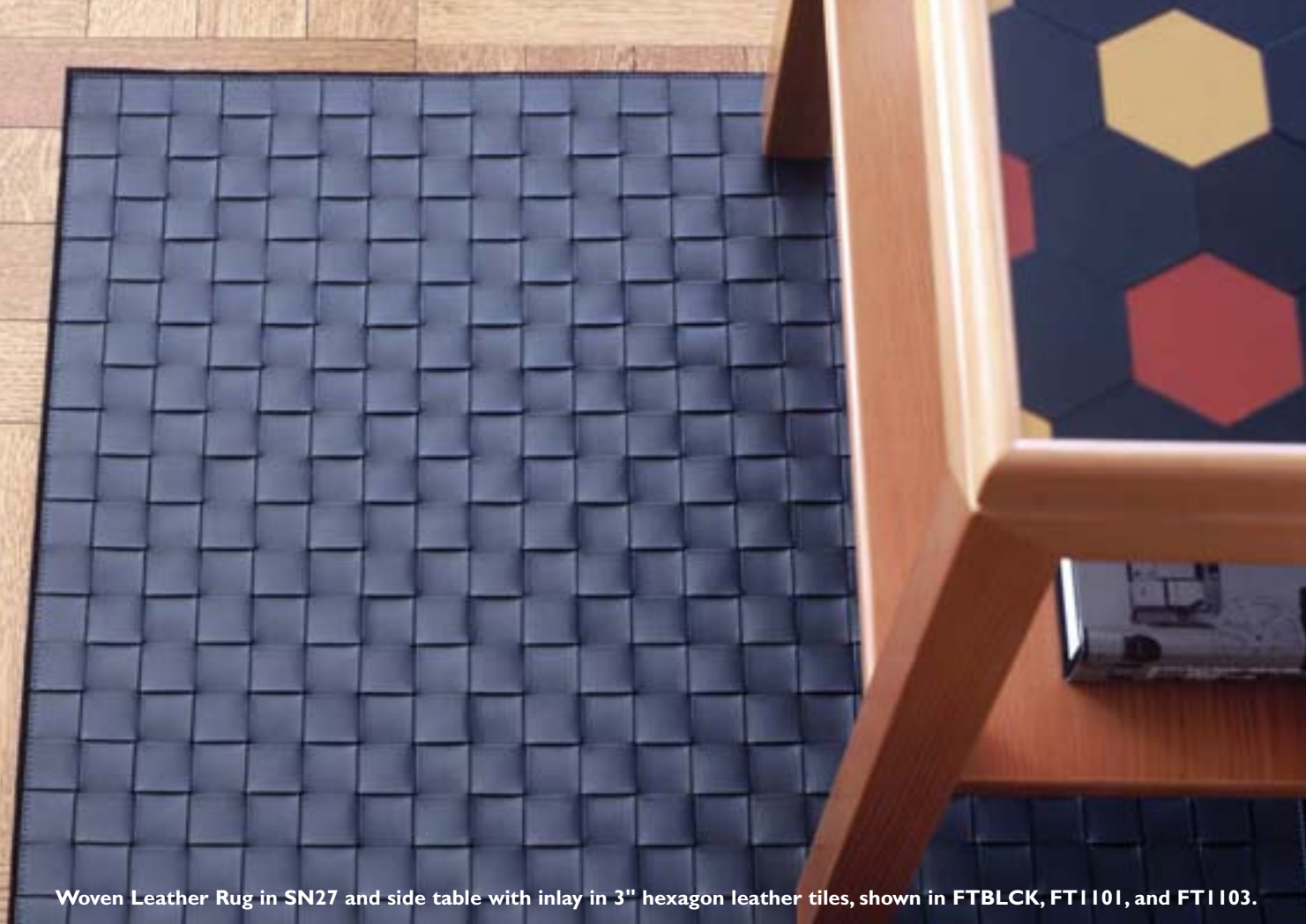
Woven Leather Rug in SN27 and side table with inlay in 3" hexagon leather tiles, shown in FTBLCK, FTI101, and FTI103.