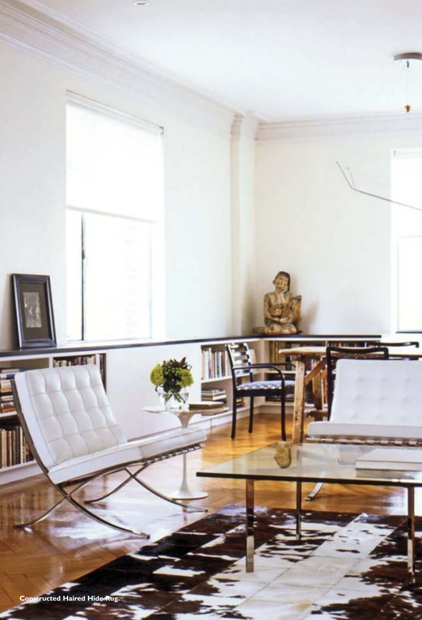
Constructed Haired Hide Rug.