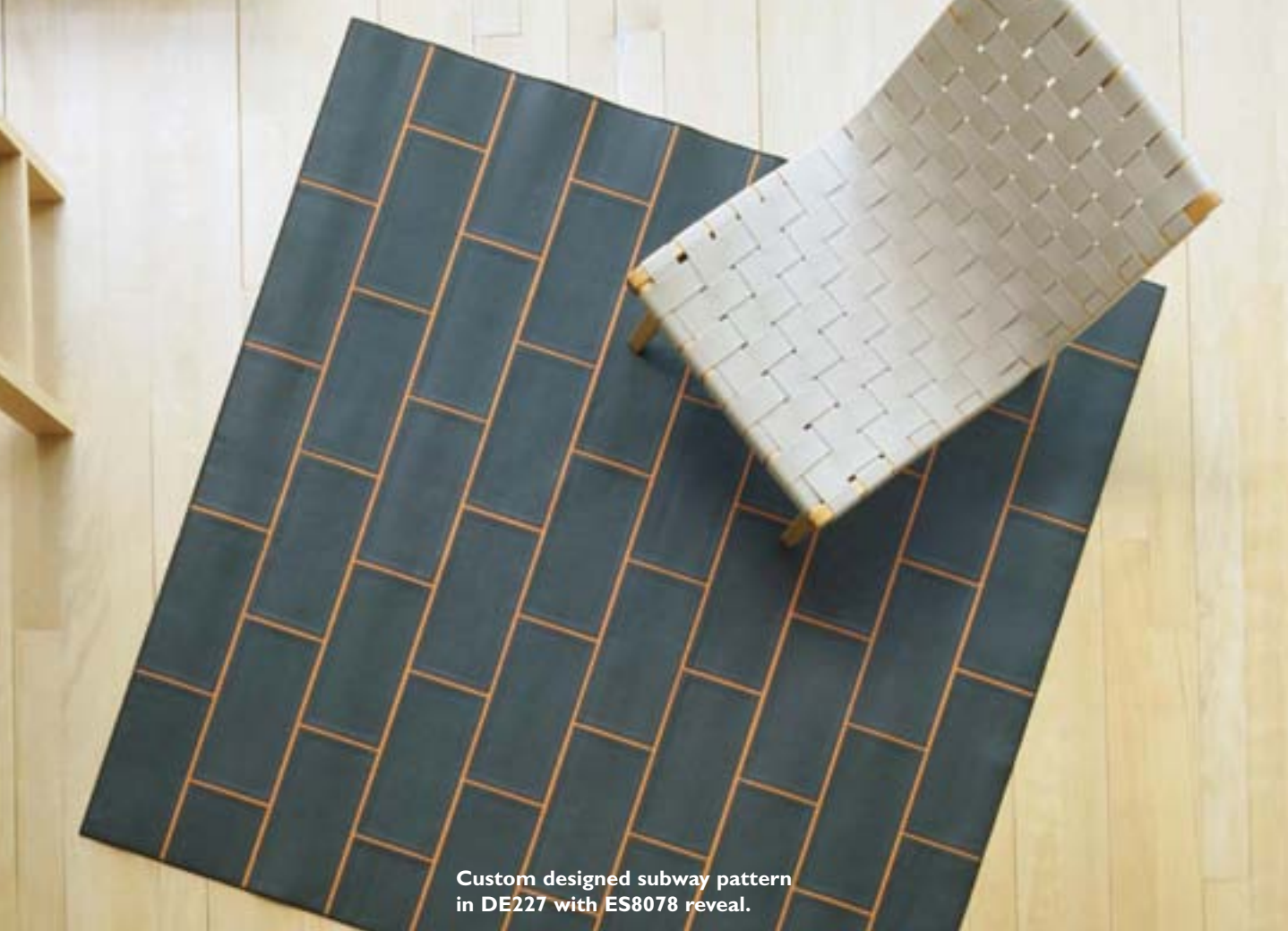
Custom designed subway pattern in DE227 with ES8078 reveal.