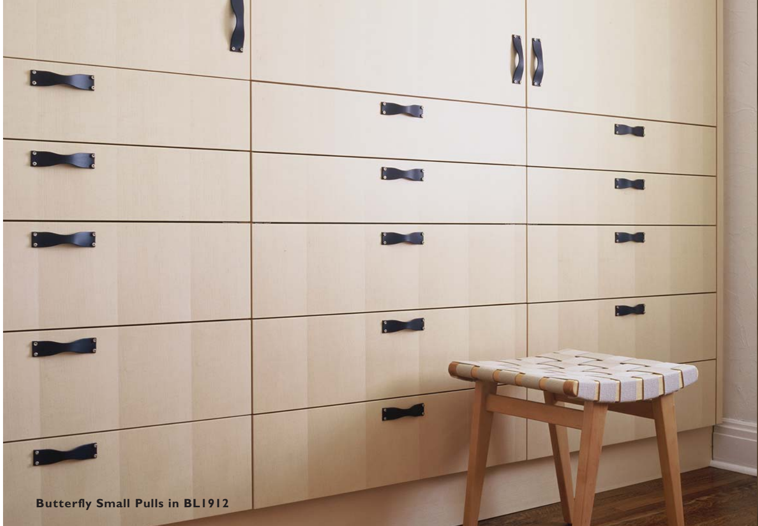
Butterfly Small Pulls in BL1912