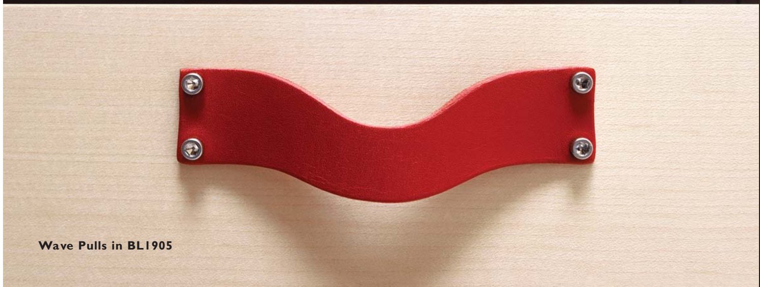
Wave Pulls in BL1905