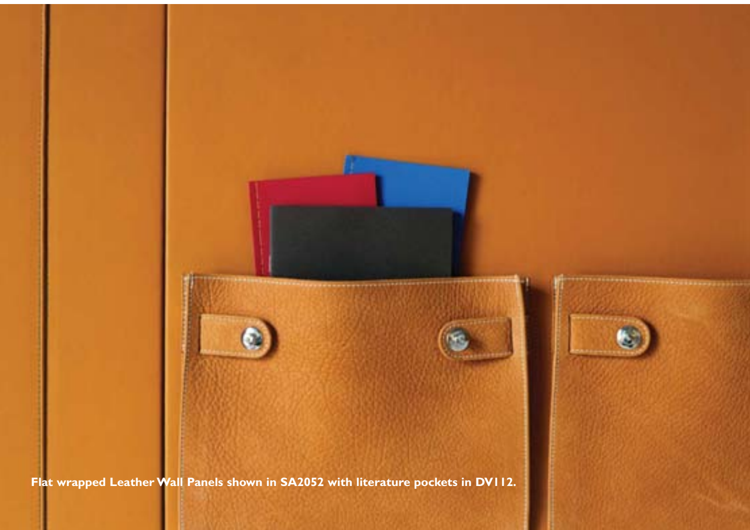
Flat wrapped Leather Wall Panels shown in SA2052 with literature pockets in DV112.