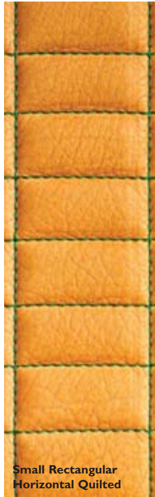
Small Rectangular Horizontal Quilted