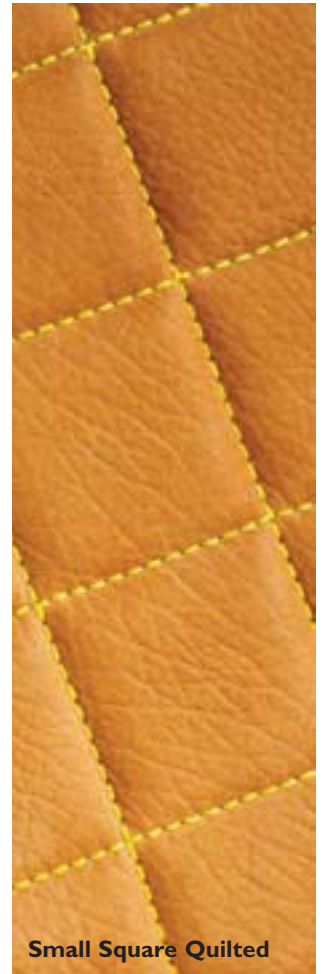
Small Square Quilted