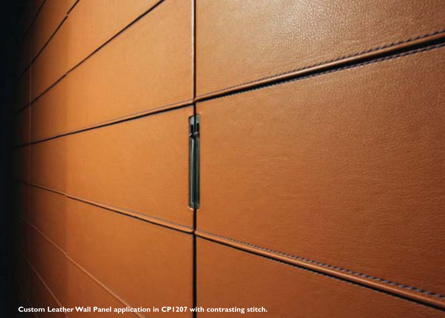
Custom Leather Wall Panel application in CP1207 with contrasting stitch.