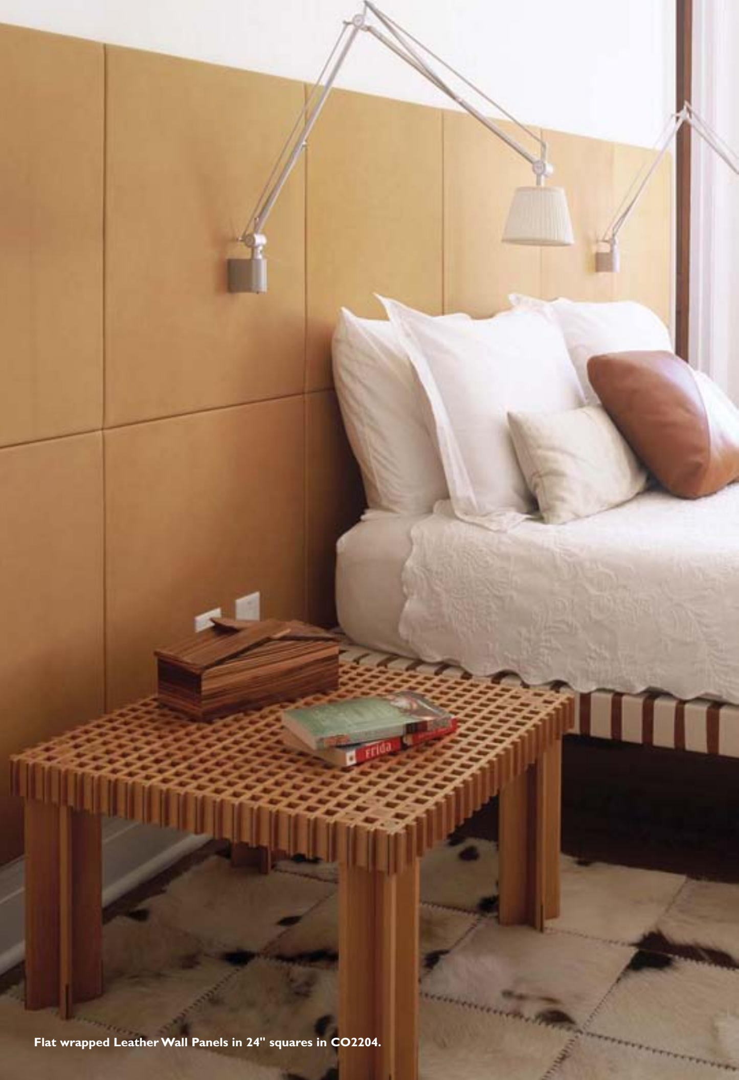
Flat wrapped Leather Wall Panels in 24" squares in CO2204.