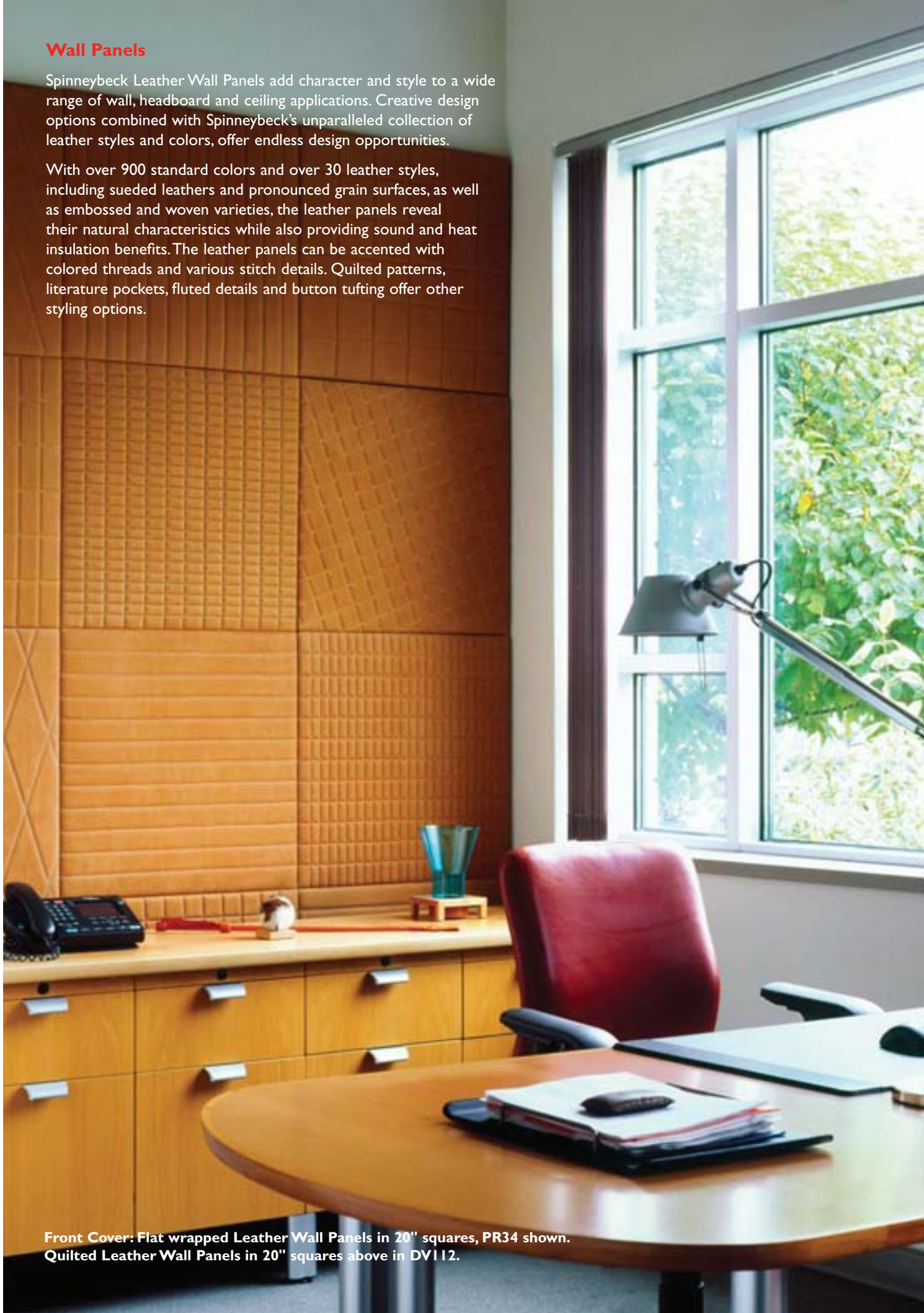
Front Cover: Flat wrapped Leather Wall Panels in 20" squares, PR34 shown. Quilted Leather Wall Panels in 20" squares above in DV112.

With over 900 standard colors and over 30 leather styles, including sueded leathers and pronounced grain surfaces, as well as embossed and woven varieties, the leather panels reveal their natural characteristics while also providing sound and heat insulation benefits. The leather panels can be accented with colored threads and various stitch details. Quilted patterns, literature pockets, fluted details and button tufting offer other styling options.