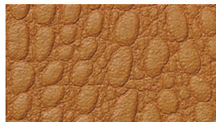
Small Belly Gator

Custom embossed samples are available upon request. Please see our Special Services Price List for additional information.