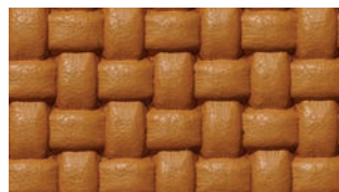
Deep Small Weave